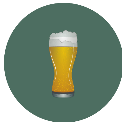
Beer 12 oz