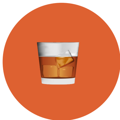
Liquor 1.5 oz