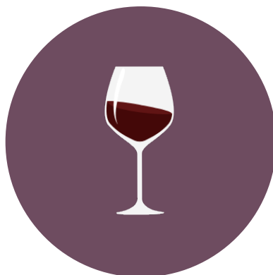
Wine 5 oz