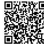
Person- Centered Thinking Presentation