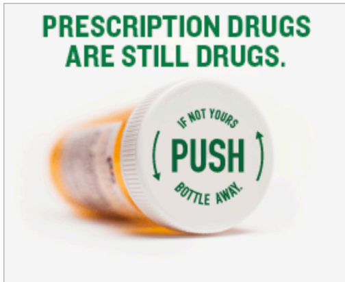
Push the Bottle Away